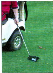
ScrambleScoop — The Quicker Picker Upper scramblescoop.com

I've seen it happen on several occasions. You are playing in a golf scramble and in your effort to lean out of the cart and swoop up your golf ball, you tumble out head over heels. Not only that, you spilled your favorite beverage. The ScrambleScoop is being called the first-ever "drive-by" golf ball retriever. The ScrambleScoop allows you to literally "scoop" up grounded golf balls while in a moving cart. The mesh catch basket is set at an angle so that all you have to do is hold the shaft out and scoop away without leaning out of the cart. ScrambleScoop inventor Betty Bucher created the product to find a solution to that problem. "I knew there had to be a better way," she says. We found the ScrambleScoop effective in speeding up golf play, and handy for picking up things in the yard or in the house. And that's the poop on the scoop. (Ciattei)