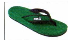
Sanuk Fur Real Sandals — From One Smooth Green to Another www.sanuk.com

We are seeing more and more companies put forth effort to create or change products to fit our environmentally sensitive world. Sir Christopher Hatton, one of the world's leading suppliers of high quality custom woven towels, has unveiled The Arbor Collection, their first-ever eco-friendly golf towel line. Combining Birchwood and cotton fibers, this is one shiny, soft and functional towel. The fabric offers increased elasticity and quite frankly is better at cleaning your clubs and balls than a normal cotton towel. With these features and a commitment to the environment, golf clubs should look into getting them onboard in pro shops, and it would make an excellent goodie bag entry for outings. There's just no need to throw in the towel when it comes to ecology! (Ciattei)