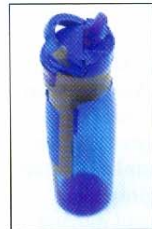
Contigo AUTOSEAL Kangaroo Hydration Bottle — Gunga Din gocontigo.com

I've seen it happen on several occasions. You are playing in a golf scramble and in your effort to lean out of the cart and swoop up your golf ball, you tumble out head over heels. Not only that, you spilled your favorite beverage. The ScrambleScoop is being called the first-ever "drive-by" golf ball retriever. The ScrambleScoop allows you to literally "scoop" up grounded golf balls while in a moving cart. The mesh catch basket is set at an angle so that all you have to do is hold the shaft out and scoop away without leaning out of the cart. ScrambleScoop inventor Betty Bucher created the product to find a solution to that problem. "I knew there had to be a better way," she says. We found the ScrambleScoop effective in speeding up golf play, and handy for picking up things in the yard or in the house. And that's the poop on the scoop. (Ciattei)